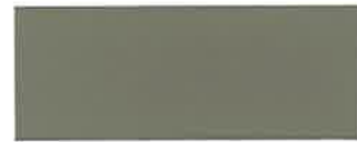
Light Bronze IR .44 SRI 49