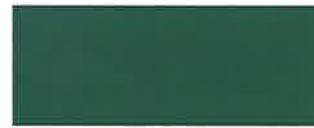
Hemlock Green IR .34 SRI 36

IR = Initial Reflectance • SRI = Solar Reflectance Index